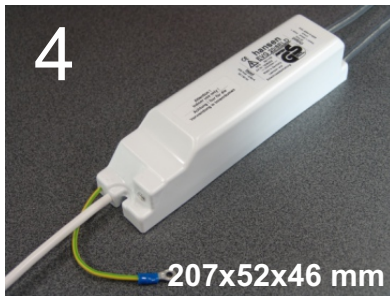
Housing colour: white All dimensions in millimetres